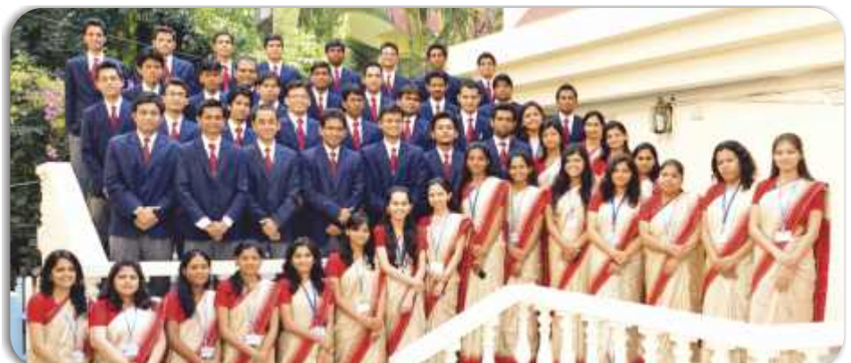
After 6 months at SCMLD