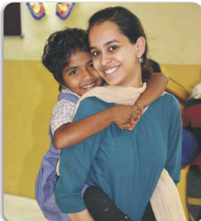
With an underprivileged child during a community initiative.