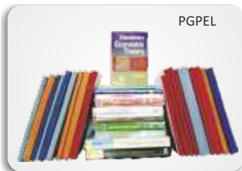
Books (personal copies) and researched study material supplied to each student with no additional charges.