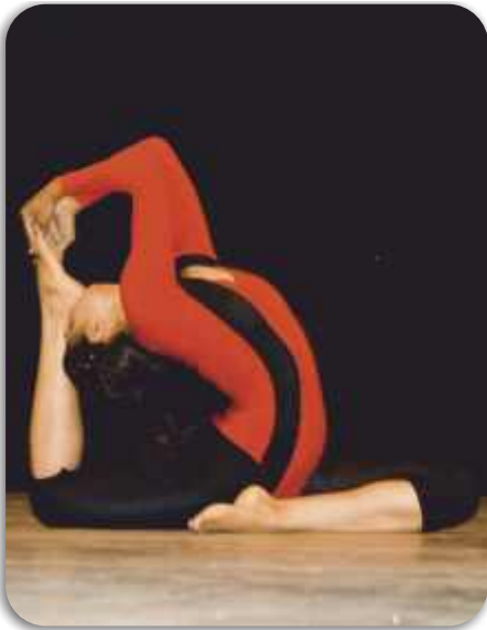
One of the yoga teachers in action

Additional Certificate Programmes: (a) Innovation & Creativity (b) Economics of Wealth Creation (c) Dharmik Leadership (d) Real Estate Business (e) Real Estate Legal System (f) Project Implementation (g) Entertainment Business etc. are being planned. These will have separate fees as these are being developed, and will be delivered by experts from the field.