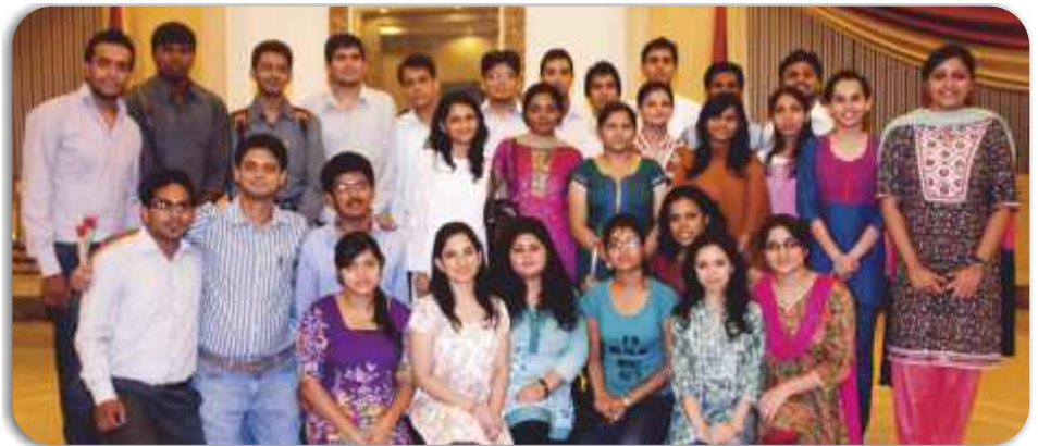
When they came in... during the induction. (6 th & 7 th June 2011)

Another three day "intellectual exploration" camp per trimester has also been added w.e.f. February 2011. Special coaching as required are provided to weak students as well if they are willing.