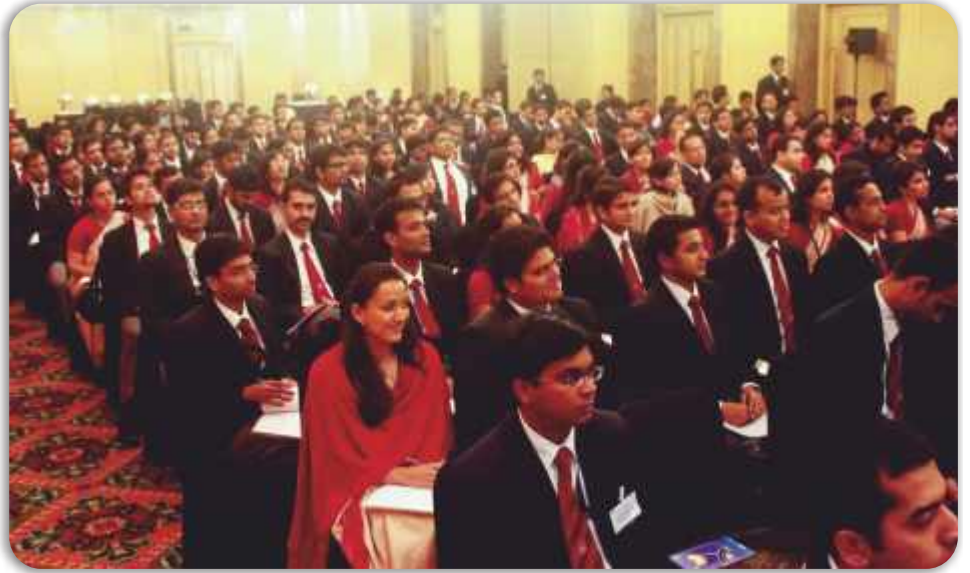
During a seminar