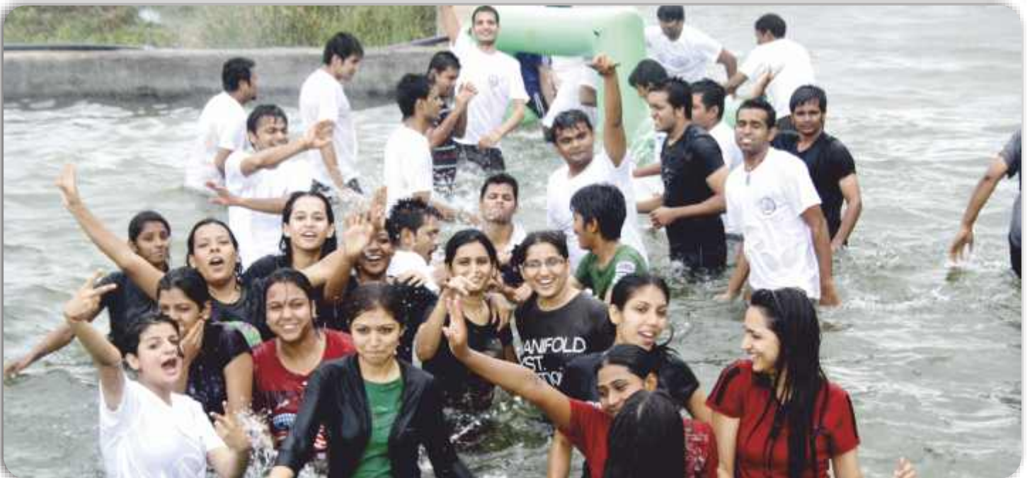
During an outbound