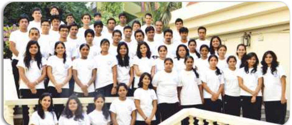
After 2 months at SCMLD